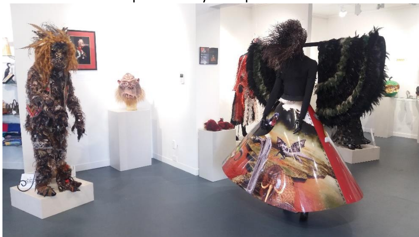
The Exhibition of wearable art