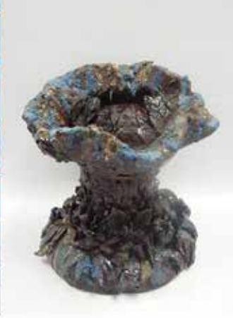
First equal Premier winner 2019: Fiona Newton