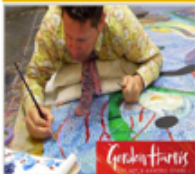
Demonstrating new acrylic materials & techniques