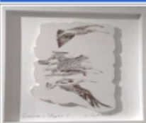
The art of Printmaking- Intaglio