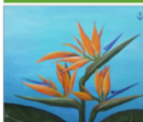
Acrylic on canvas

Please note that EACT IS NOT taking bookings for this workshop.