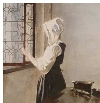
"HELEN E. DOUGLAS" G5: GALLERY FIVE (UPSTAIRS) AND CAFE