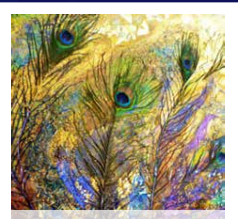
"Feathers n' Things" Shirley Oxborough 30 Oct to 26 Nov

214b Hibiscus Coast Highway, PO Box 480, Orewa | 09 4265570 | www.estuaryarts.org