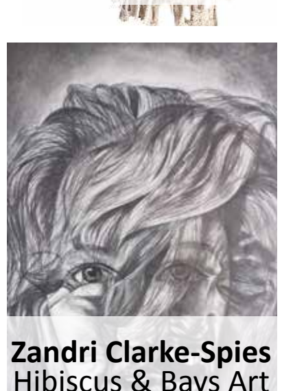
Hibiscus & Bays Art Awards Youth winner