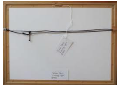
Swing tag & string

All artwork MUST have a swing tag which has the artist name, title of work, medium and price. Why do we need a swing tag? When the work is installed and we go around to put up the labels we can check that the details are correct and not have to handle your artwork unnecessarily. Once correct we flip the swing tag over the picture.