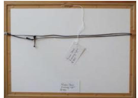
Swing tag & string

All artwork MUST have a swing tag which has the artist name, title of work, medium and price.