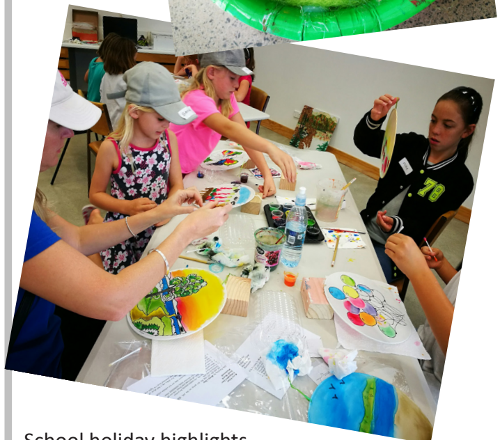
School holiday highlights