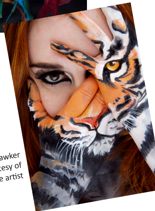
Artist: Lara Hawker