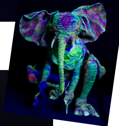
Magdalena O'Connor Image: Cactus Photography NZ Body Art Trust