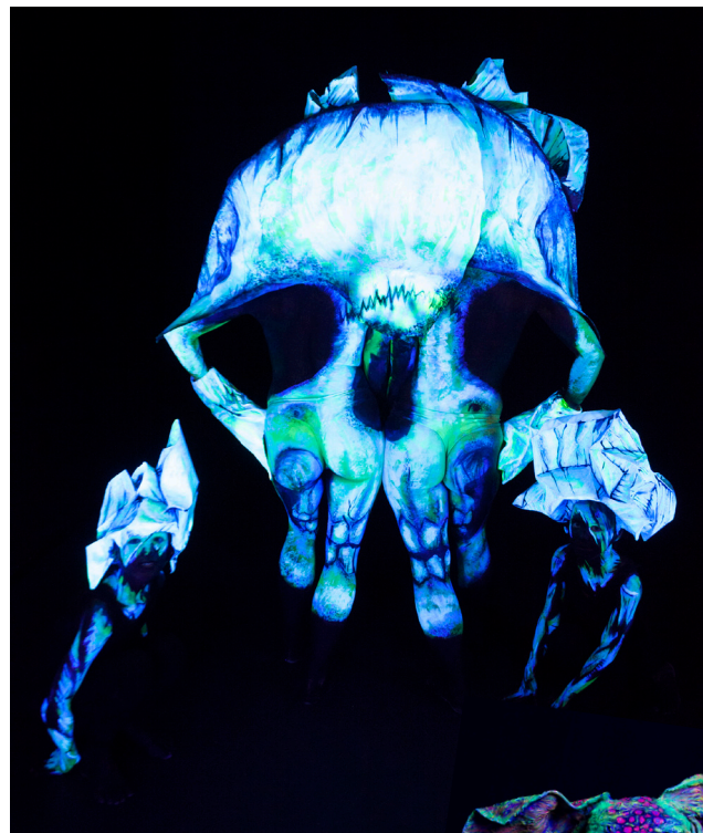
Artist: Amelia Hitchcock Image: Cactus Photography NZ Body Art Trust