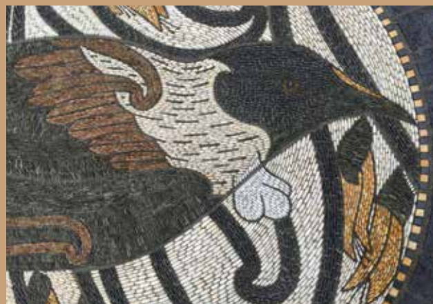
Above: close up of the Bastion Point Tui mosaic.