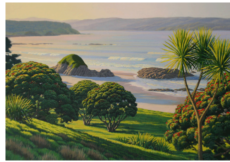
EBW3: Acrylic Landscape Painting with Eion Bryant