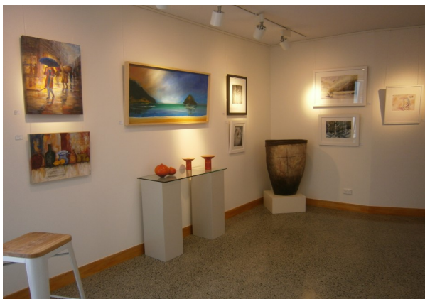
The brand new foyer exhibition space, located in the Education Wing is light and modern and ideal gallery space for small exhibitions. Contact the Centre for more details