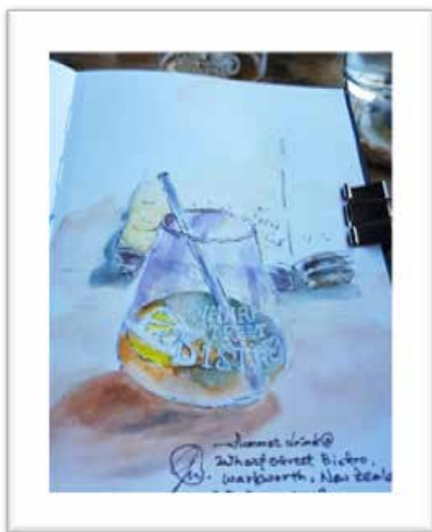
(Left) Wharf Street Bistro, Warkworth

As an artist, I found that doing sketching during my travel helps me observe the subject that I am sketching better. I can even use watercolour or other medium to help capture the mood! Not to mention, the travel sketching I have done throughout the years have served a better memory of my journeys than the photos I took."