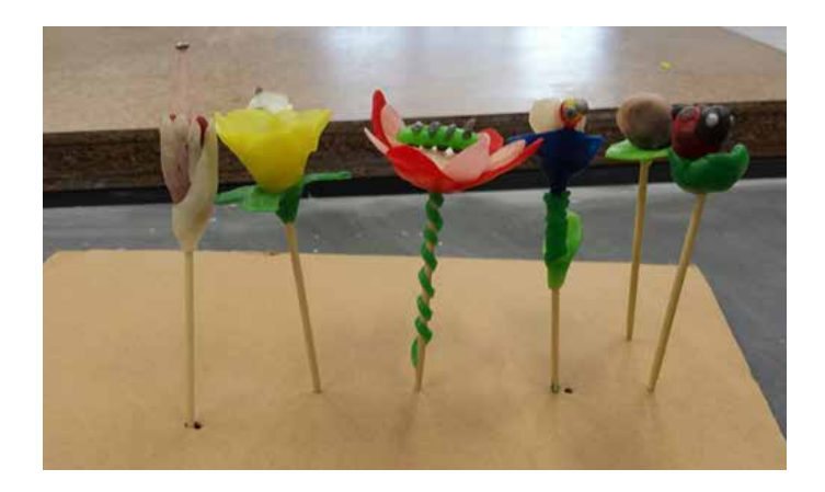
One of the wax flower gardens produced by students in Sue Law's Fascinating Flowers School Holiday class.

were very successful, seeing a diverse range of students from the local community getting their doses of creativity for the holidays. We are very lucky to have some incredibly talented tutors on board at the Estuary Arts Centre who thought up a vast array of learning and creating activities for the children involved. We had clay bee hives, wax flower gardens, Monster parties and children turning themselves into Zombies with SPFX makeup, to name just a few of the activities on offer. Most importantly there was also a lot of fun!