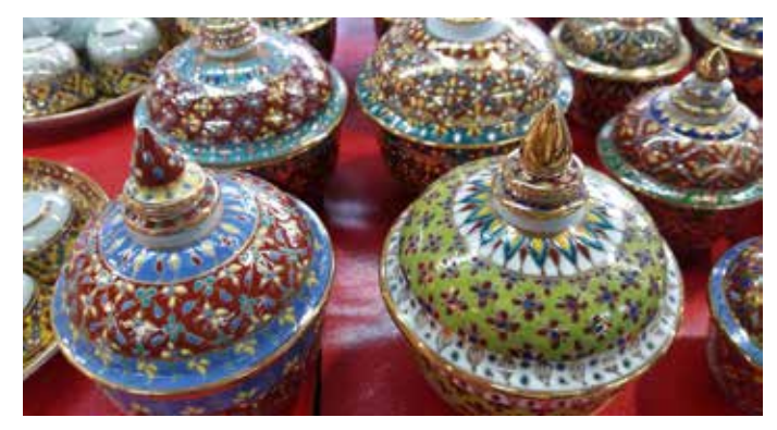
Thai ceramic bowls

This was my first trip to Thailand and I relished the clawing heat, the temples embellished with crimson orange and sumptuous golds, the rich textiles and even the overcrowding, it was a feast for the senses.