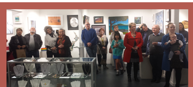
The 2017 EAC Members Merit Awards - opening function Thursday 03 August