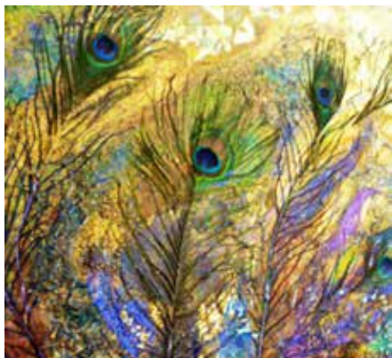
“Feathers n’ Things” Shirley Oxborough 30 Oct to 26 Nov

214b Hibiscus Coast Highway, PO Box 480, Orewa | 09 4265570 | www.estuaryarts.org